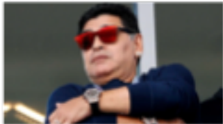
Diego Maradona sports two matches during a World Cup match