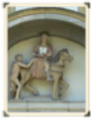
MARTIN'S VISION OF JESUS CHRIST